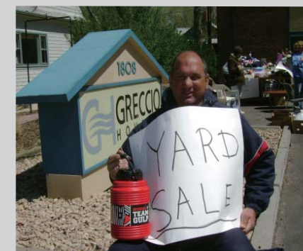
Residents plan and run a yearly yard sale that funds a resident scholarship.