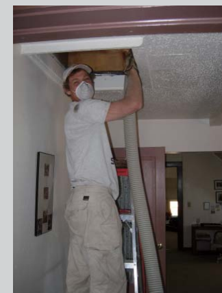
Greccio held its first Energy Efficiency Day at its North Weber property.

Providing our residents opportunities today for a better life tomorrow.