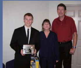
Greccio's Resident Council awards an annual scholarship to a Greccio Housing resident.

In 2002 Greccio established its Resident Enrichment Program with the goal of helping residents by providing and coordinating a wide range of supportive services that will promote their stability, self-sufficiency, independence, and assimilation into the broader community. Core services include emergency financial assistance for rent and utility delinquencies to avoid eviction, crisis resolution, information and referral to community resources, financial literacy services, employment related services, and academic enrichment. We support our residents by listening, sharing our resources, and caring about their well-being.