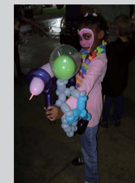
There was face painting and balloons at Greccio's annual Resident Picnic.

Providing our residents opportunities today for a better life tomorrow.