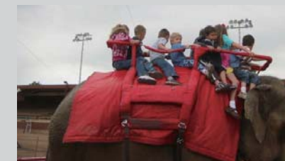
Greccio residents enjoyed a special trip to the circus and an elephant ride.